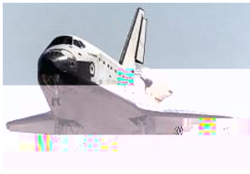
Space Shuttle Endeavour landing in 2001.

Learn more about the four forces of flight: howthingsfly.si.edu