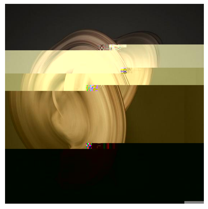
Fig. 1. Shinichi Maruyama, Nude 9, 2012

an end. I began to look at my own use of the technique as a way to represent the odd nature of the passage of time in hypnagogia and the dream state beyond.