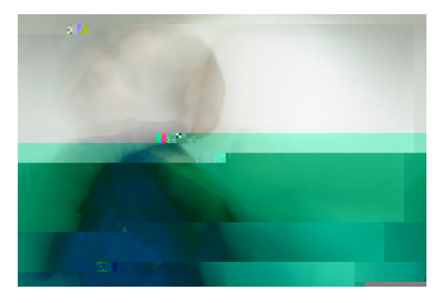
Fig. 5. Kathryn Reichert, I Would Go With You, 2018